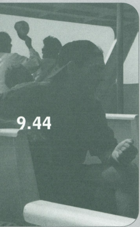
Rem Koolhaas whalewatching off Cape Cod, August 1994

26 Large Every architect worth his salt has restricted taste and can't do everything. This is a grave disadvantage in the modern and post-modern worlds which demand that the architect be everywhere and design everything yesterday. In my 35 years as a critic, I have known over 100 architects well, maybe 1,000 superficially, and 10,000 through the media. There is not one that is adequate to the job: be everywhere, do everything. I offer this truth to the architectural profession: there is no right method, single style, adequate sensibility for any job over 10,000 square feet. The profession has not thanked me. The rule is: break up bigger jobs into smaller chunks, dole them out to different architects; change sensibilities every 10,000 square feet. Rem, with his Small, Medium, Large, Extra Large philosophy, doesn't want to know. He has divided up Lille when it gets Extra Large, but not when it's Medium. He is still too much a Bolshevik at heart, and when I reprove him for this and tell him post-modernism was created to protest the "Too Big" he's not interested. Rem wants to be, like Kubitschek, Robert Moses, and Le Corbusier, "Too Big."